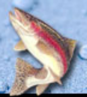
Striped Bass Data 2002 -2009