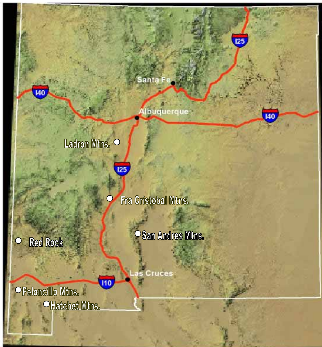
Figure 1. Occupied desert bighorn sheep ranges in 2003.