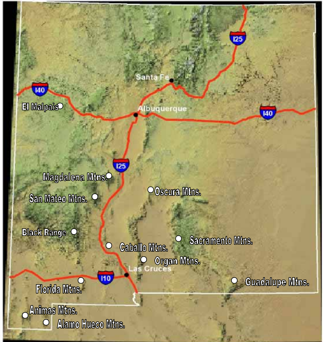
Figure 2. Unoccupied desert bighorn sheep ranges in 2003.