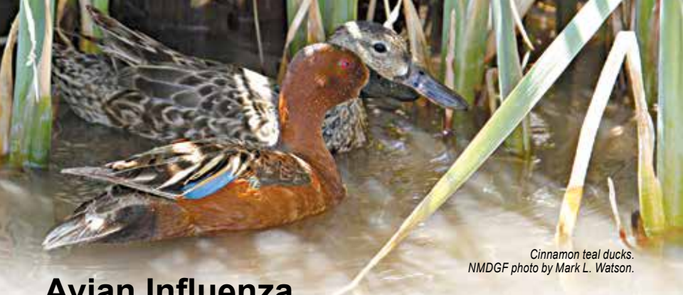
Cinnamon teal ducks.