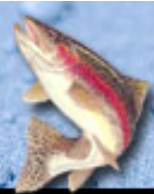
Striped Bass Data 2002 -2009