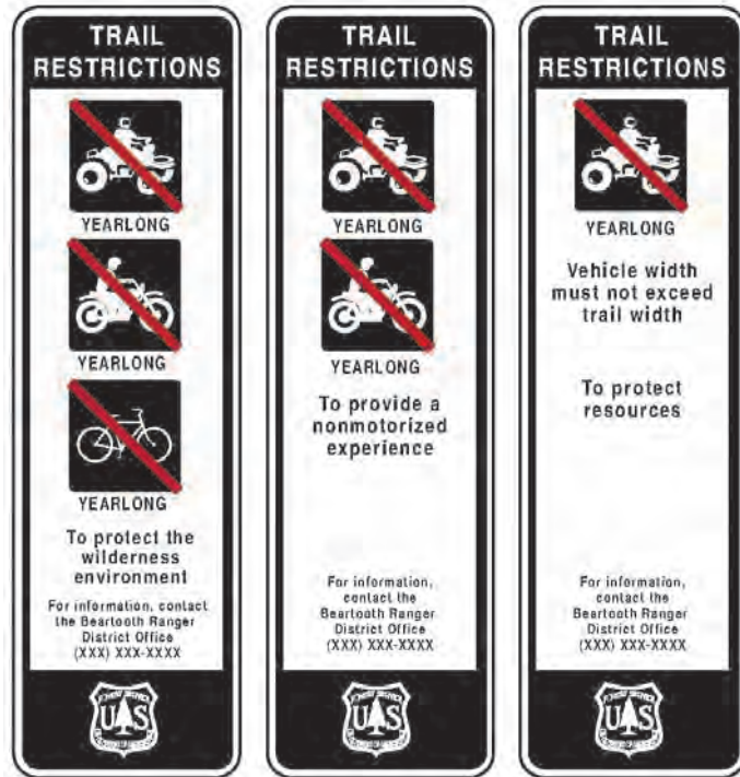
Trail Management Signs