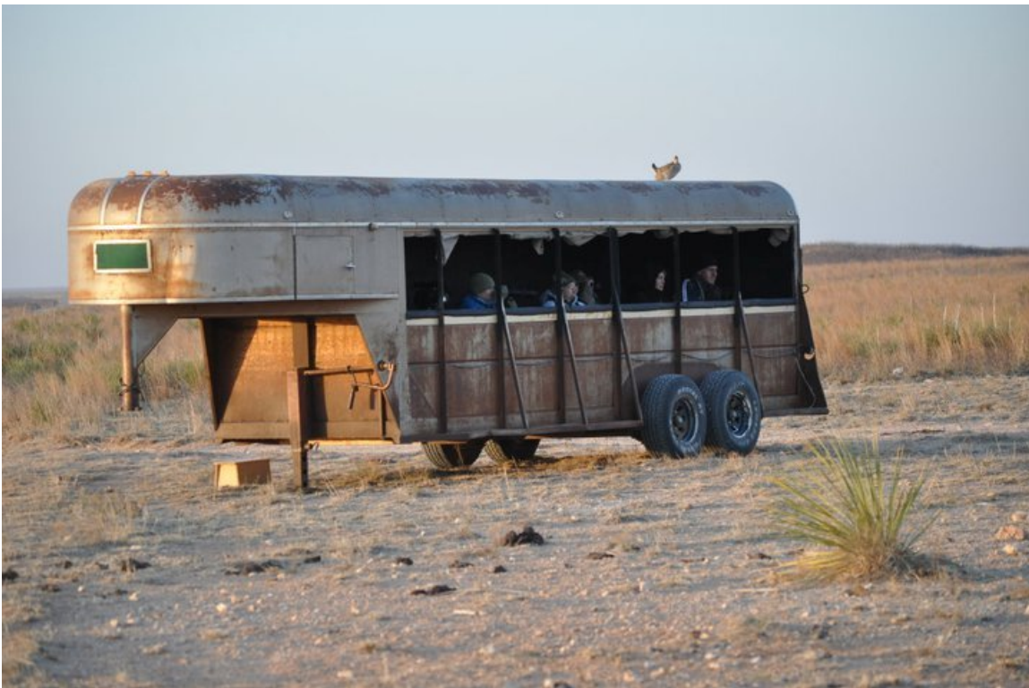
Old livestock trailer converted to mobile photo blind.

For those of you who would like the elbow room to exercise more serious photo equipment, (big lenses, etc.) we offer space in a mobile photo blind on a first-come-first-served basis and for an additional fee of $35 per day. Space is very limited, and once again, this opportunity is designed for photographers. As is the case with the vans, we are able to get rather close to the birds (see photo)!