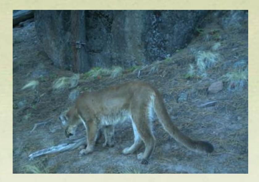
November 21, 2019 Bear and Cougar Rule Roswell, NM