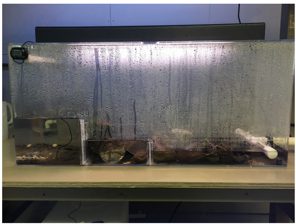
Figure 2. Aquarium at the Albuquerque BioPark Conservation Facility being "inoculated" with water and substrate from Alum Spring prior to the introduction of P. gilae and P. thermalis .