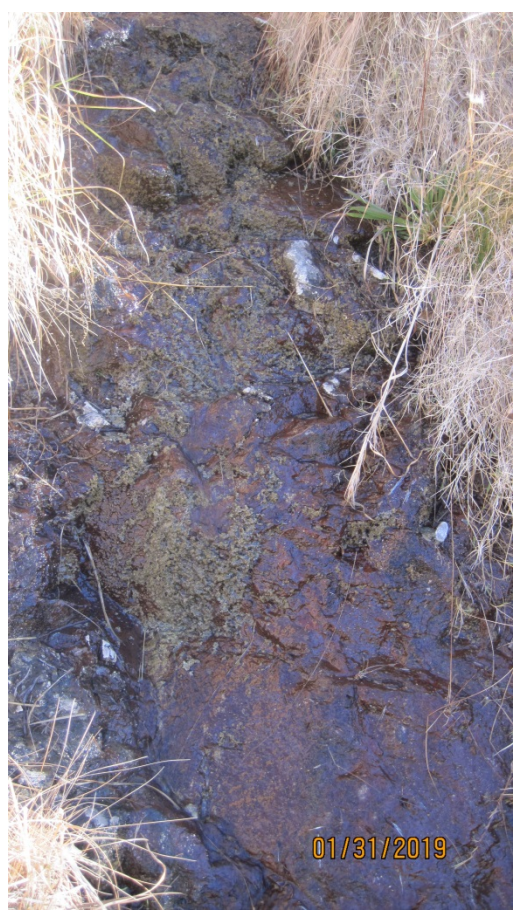
Figure 5. Surface from which P. gilae and P. thermalis were collected at Alum Spring, NM.

Figure 4. Trip to the Gila Wilderness to collect substrate and water from Alum Spring.