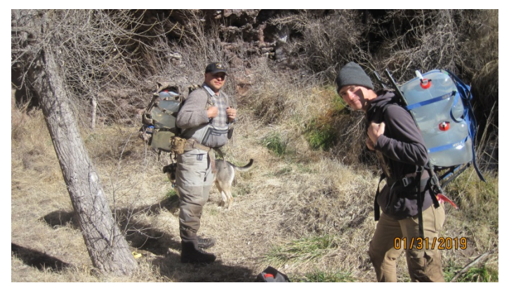
Figure 4. Trip to the Gila Wilderness to collect substrate and water from Alum Spring.