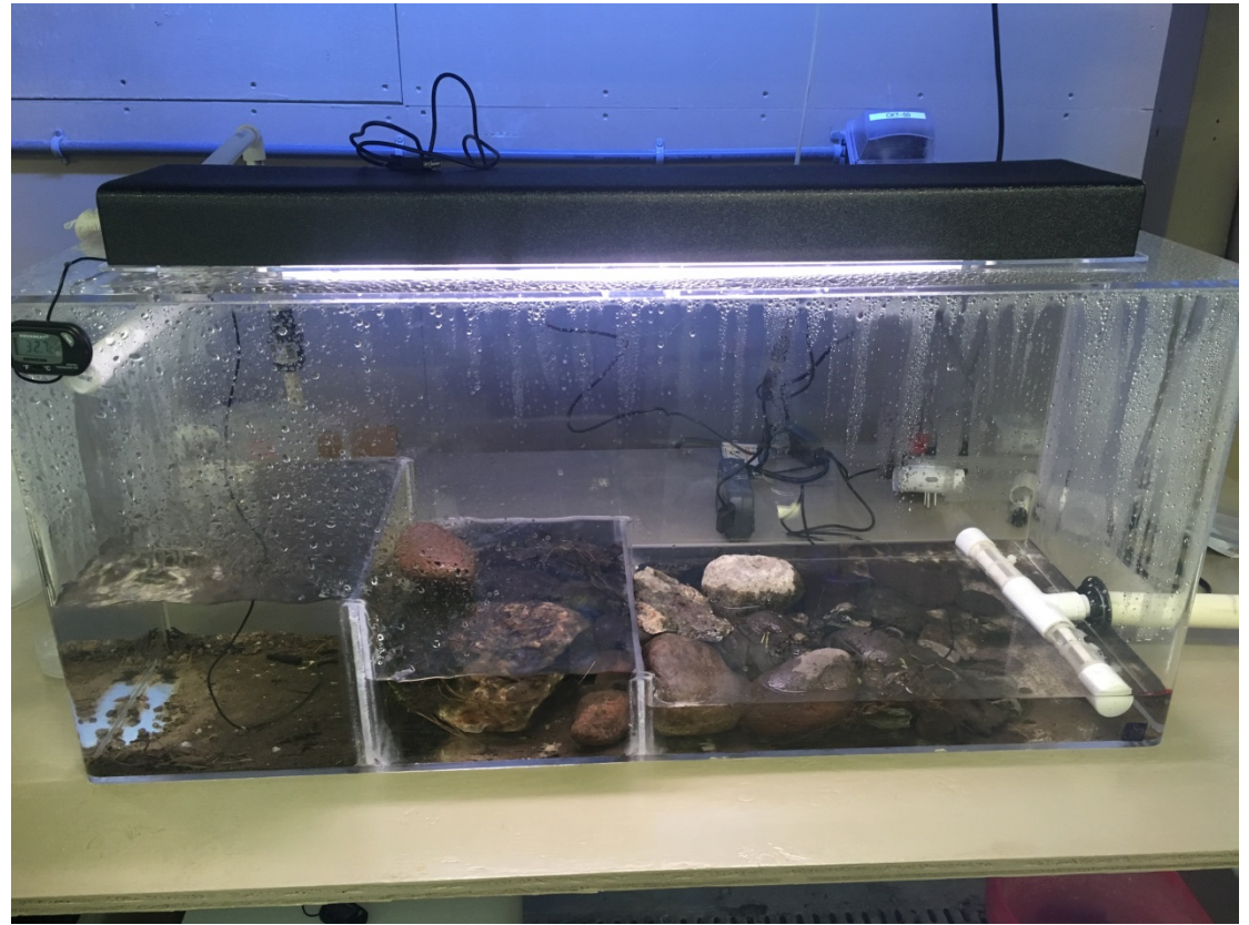
Figure 3. Baffle system developed to mimic vertical and horizontal flow found at Alum Spring.