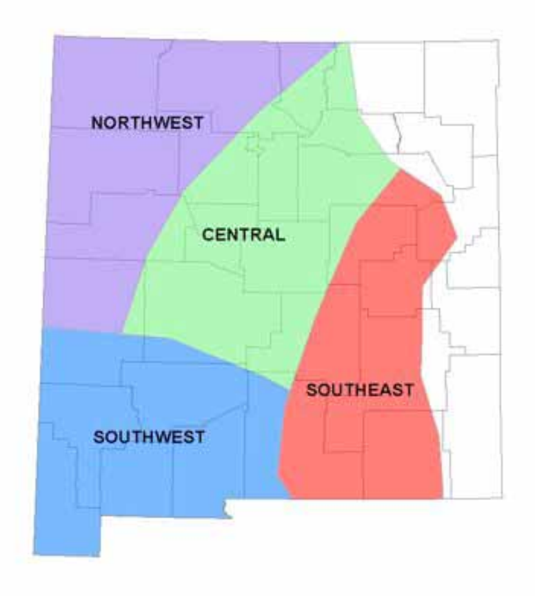
Figure 1. Gray Vireo Recovery Plan Management Units.

Section 2 includes background information on the natural history, historical perspective, habitat assessment, and potential economic and social impacts of this Plan. Section 3 contains the goal for the recovery of the Gray Vireo, accompanying objective, the issues affecting the recovery of the species, and the strategies for addressing those issues.