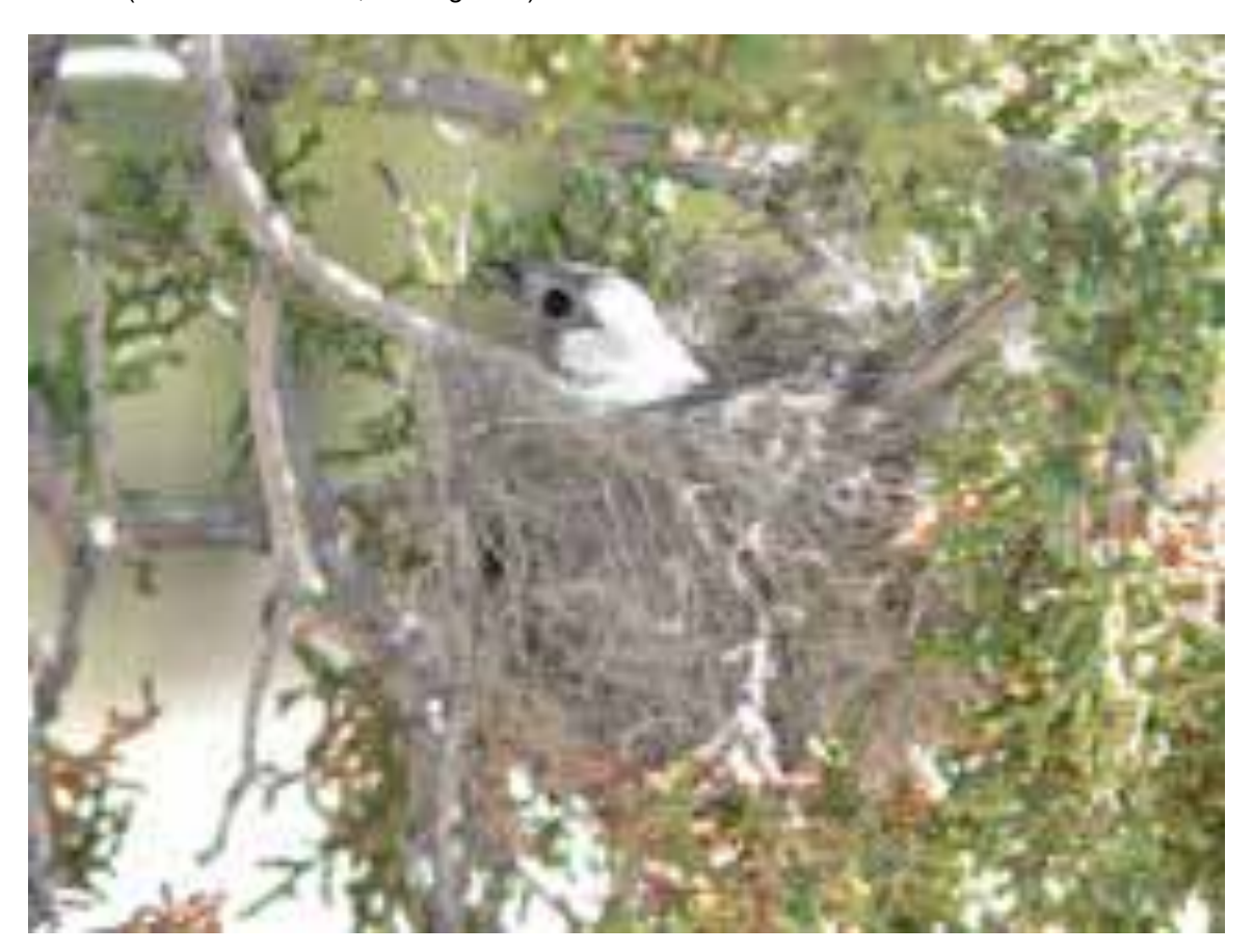
Figure 5. Male Gray Vireo incubating nest.

Breeding. Unmated male Gray Vireos sing from exposed branches, often at the top of a tree and may use its pale gray breast as a form of signal for potential mates (Barlow et al. 1999). Nesting Gray Vireos are territorial, with males maintaining the territory through song and patrolling of the perimeter. Territory size varies in part with population density, ranging from 2.0 – 4.0 ha (4.9 – 9.9 ac) in Texas to 7.0 ha (17.3 ac) in Colorado (Barlow et al. 1999). Some fighting takes place between males, with most agonistic displays consisting of spreading and closing of the long tail, puffing the breast and back feathers, and the erecting of the crest (Barlow et al. 1999). Females will on occasion emit a scolding call toward an intruding conspecific. Males will chase intruders. Birds give scolding calls and will attack and chase potential nest predators. Both sexes sit tightly on nest (Barlow et al. 1999, see Figure 5).