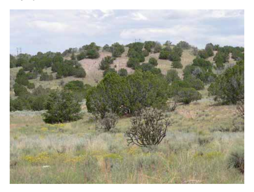
Figure 8. Gray Vireo habitat, Santa Fe County, New Mexico.