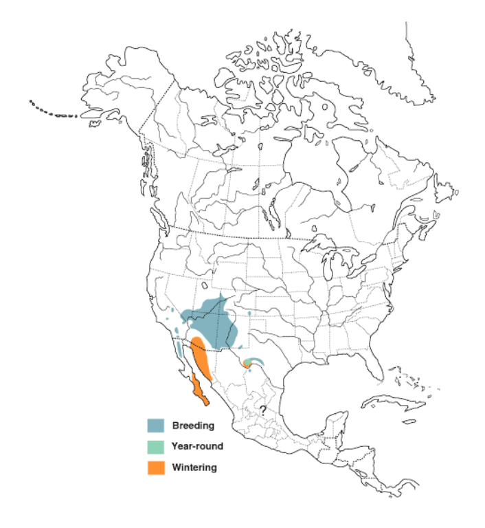
Figure 2. Overall distribution for the Gray Vireo (Barlow et al. 1999).

<u>Current</u>. The Gray Vireo breeds only in the southwestern United States, northern Mexico, and Baja California Norte, Mexico (Figure 2). Wintering range is Baja California Sur, Mexico, coastal and lowland areas of Sonora, Mexico, and north into southwestern Arizona. A separate population winters in the Big Bend region of Texas, and perhaps is present there year-round (Barlow et al. 1999). In Arizona and Utah the Gray Vireo was found at lower densities than other songbirds of the region (Schlossberg 2006). Within New Mexico, the species is found throughout the state west of the Great Plains, but with an extremely patchy distribution often composed of small sites each having less than 10 territories (Figure 3). However, over 80 percent of the Gray Vireo territories in New Mexico are found in 12 sites, the largest site found in the Guadalupe mountains west of Carlsbad, NM (DeLong and Williams 2006, Figure 4). Density from five sites in the state range from 0.2 to 0.9 birds/40.0 hectares (0.2 – 0.9/98.8 acres; DeLong and Williams 2006). Currently estimates are that 418 Gray Vireo territories have been documented in New Mexico; this is an upper estimate, but, with further systematic survey work, other populations are likely to be found in the state (DeLong and Williams 2006).