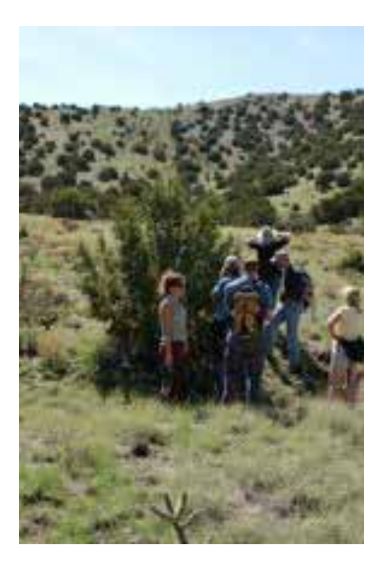
Figure 7. Juniper (Juniperus spp.) used for nesting by Gray Vireo, Bernalillo County, New Mexico.