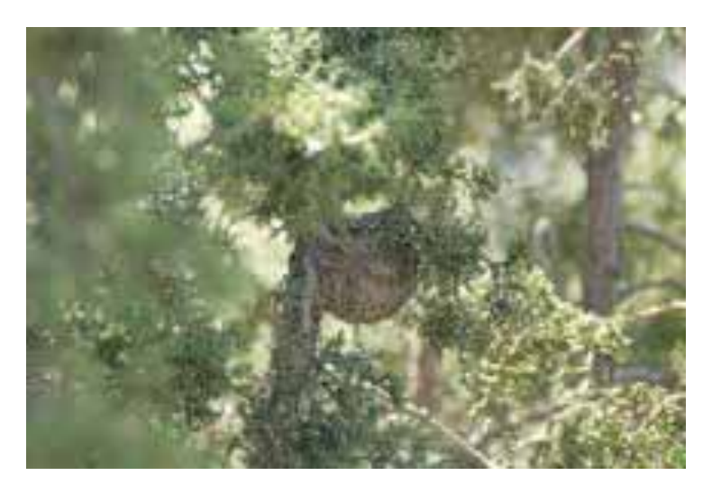
Figure 6. Gray Vireo nest in juniper (Juniperus spp.), Bernalillo County, New Mexico.

Nest typical of vireo family in that it is a cup hanging from forks in tree (See Figure 6). Construction of nest takes approximately five days, beginning with equal efforts by both parents before the female takes over the majority of construction (Barlow et al. 1999). Nests are constructed of woven grasses, bark, plant fiber, spider webs, and cocoons, and lined with fine grass, hair, and thistle down (Barlow et al. 1999, Bent 1950). Dimensions of nests measured in Colorado ranged from 45 - 70 mm (1.8 - 2.8 in) in height, 50 - 85 mm (2.0 - 3.4 in) outside diameter, 35 - 71 mm (1.4 - 2.8 in) inside diameter, and 28 - 48 mm (1.1 - 1.9 in) cup depth.