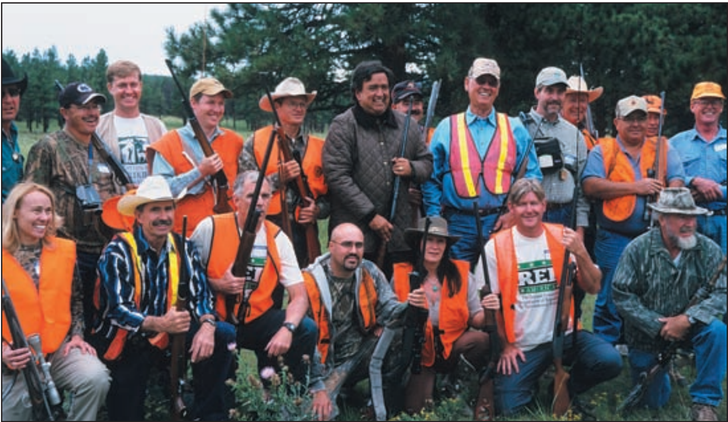
New Mexico Governor Bill Richardson and a posse of supporters rallied at the Valle Vidal in August, vowing to protect the area's waters and oppose oil and gas drilling.