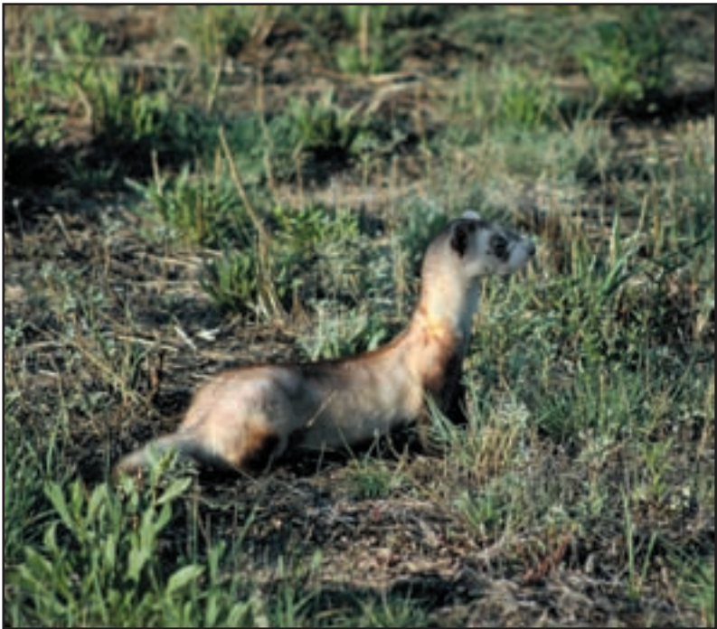
(below) Adult black-footed ferrets are 18 to 24 inches long and weigh about 2 ½ pounds.