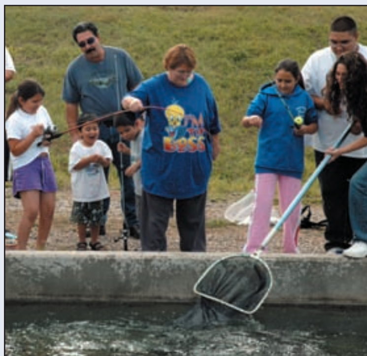
Action was nonstop Sept. 24 at Parkview Hatchery in Los Ojos, where about 150 adults and children caught and filleted more than 1,500 trout.