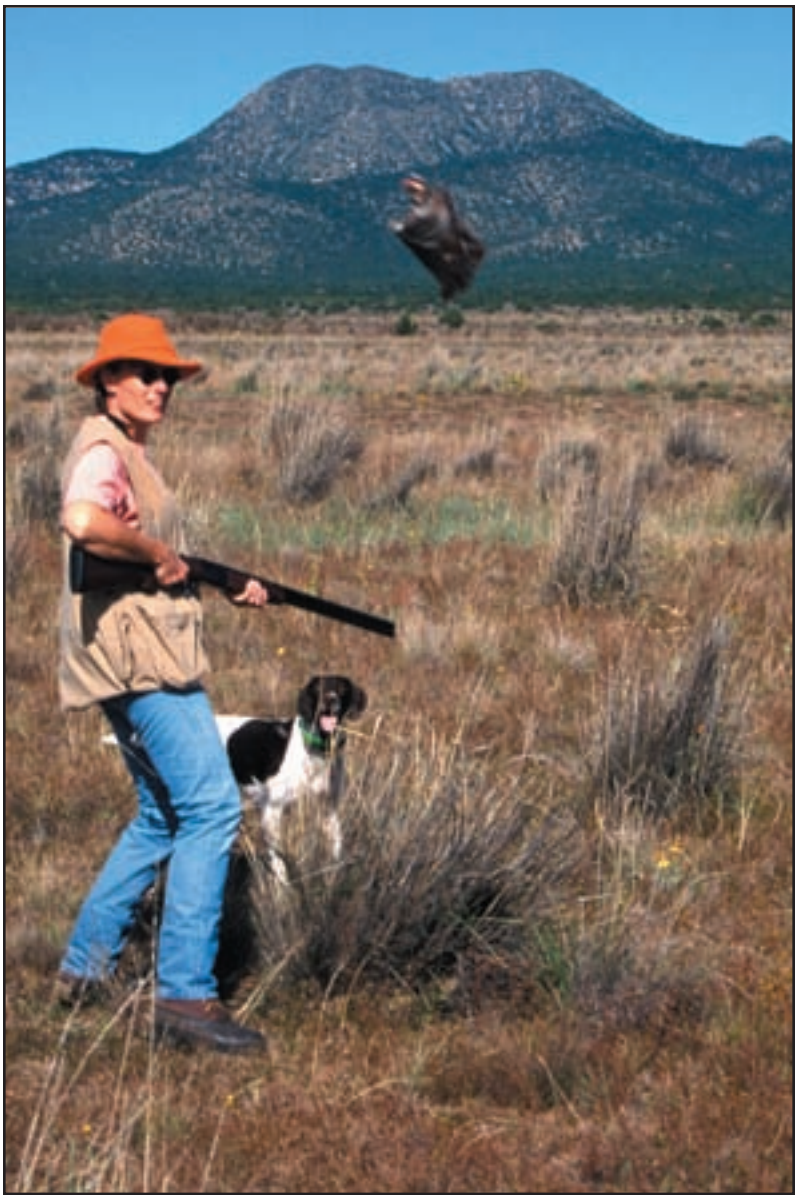
Trained bird dogs allow hunters to flush game within gun range every time.