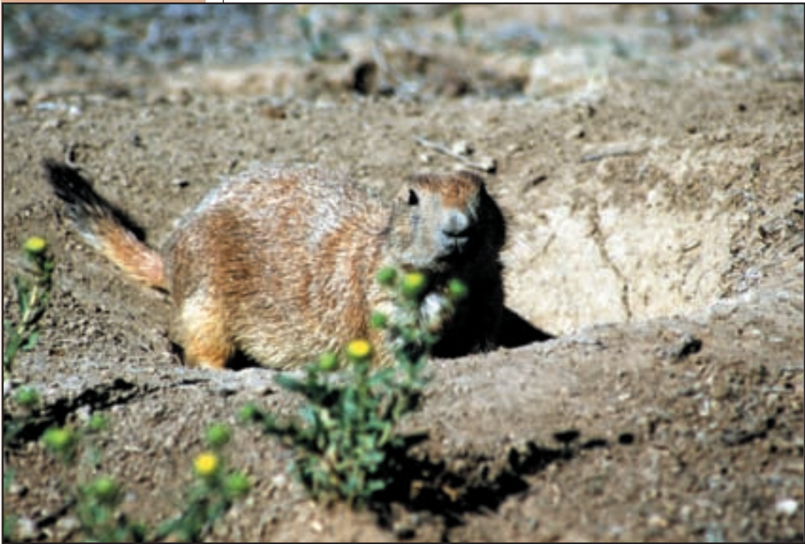
Black-tailed prairie dogs comprise 90 percent of ferrets’ diet.

With its sprawling 60,000 acres of contiguous shortgrass prairie, Vermejo Park might appear to be an ideal location as a permanent release site. Chuck Hayes, an endangered species biologist with the New Mexico Department of Game and Fish, said such a project could contribute to ferret recovery. The major question is whether even that much property could support enough prairie dogs to accommodate a viable population of ferrets.