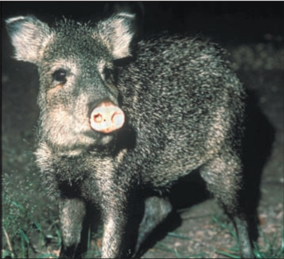
(above) Javelinas occasionally will feed at night, especially during the hot summer months.