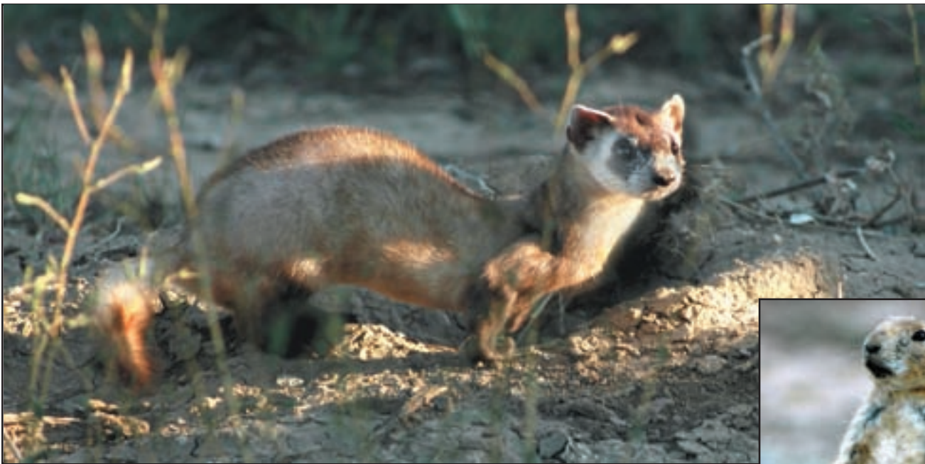
(above) An endangered black-footed ferret makes a rare daytime appearance from her burrow at Vermejo Park Ranch.