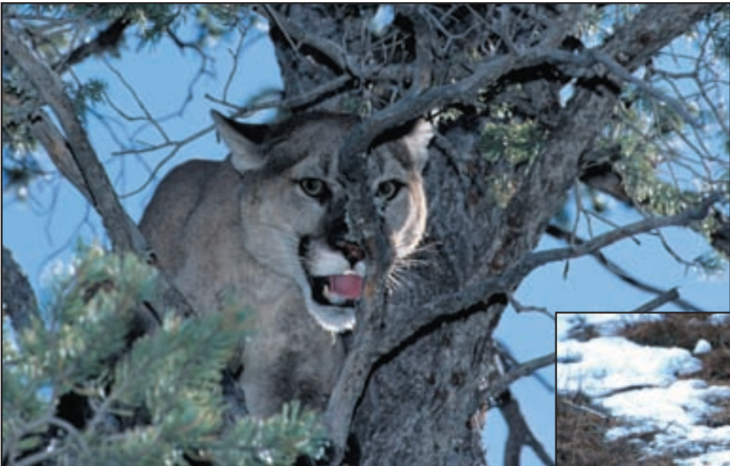
(left) The New Mexico Legislature gave the mountain lion status as a protected game animal in 1971.