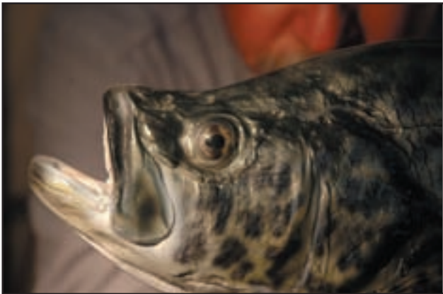
Crappies' large eyes help them find food at night.

Vision is not one of the strongest senses for fish. Most fish are nearsighted and can see only about 10 to 20 feet. Fish may be able to see only a few inches away if the water is murky. The eyes of fish are on the sides of their heads. Their eyes cannot open or close because they have no eyelids. Fish are able to use each eye on its own and can see almost all around them, including above. A good angler will remember this and try not to be seen by the fish. Fish such as bluegill, trout and minnows that feed during the day have fairly good vision and can see a range of colors because there is sunlight in the water. Night feeders such as walleye and crappie can see well when there is not much light, partly because they have very large eyes that can capture more light. However, they cannot see colors.