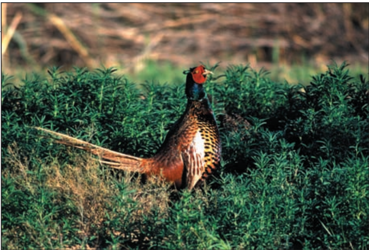
Pheasants were first released in New Mexico in the early 1900s.