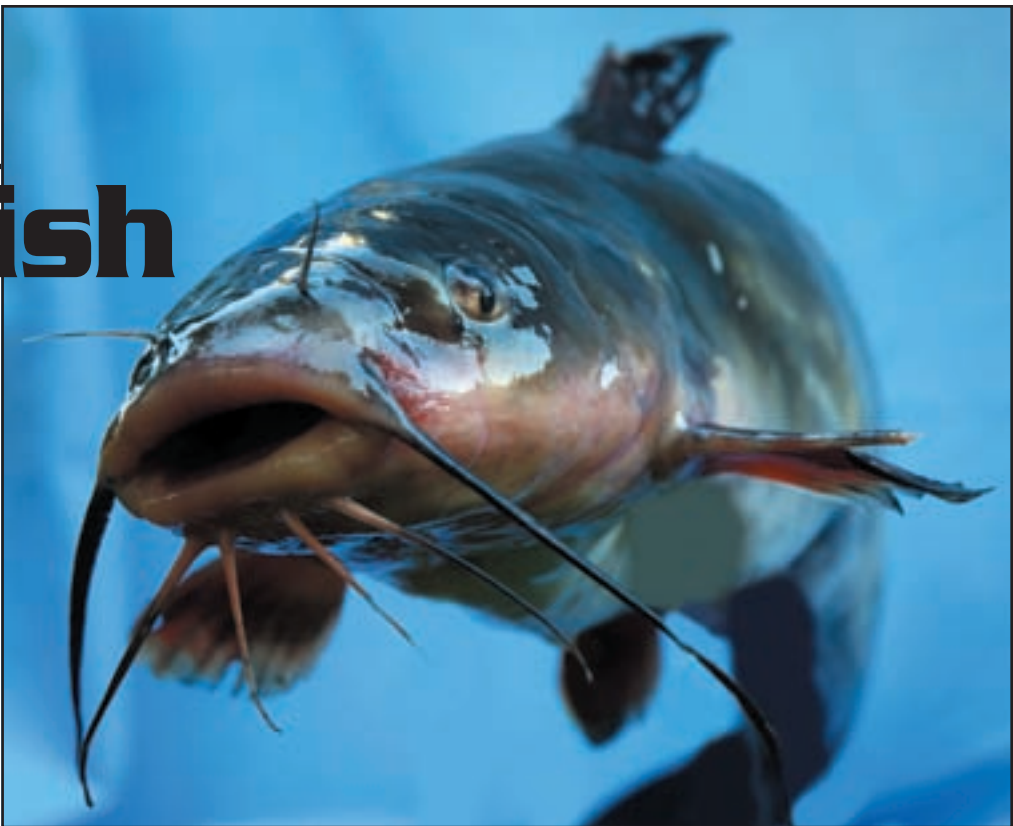
Catfish "whiskers" or barbels, are sensitive to touch and covered with taste buds.

Fish have a receptive system called the lateral line that detects vibrations and pressure. Humans can sense things through touch. The lateral line provides a kind of touch sense for fish. The lateral line begins just behind the head and runs along each side of a fish's body. The lateral line is covered with tiny, sensitive hair-like nerve endings known as neuromasts. As fish move through the water, the water is pushed, causing the hairs of the neuromasts to vibrate. A signal is sent to the brain, aiding the fish's sense of hearing. Fish can detect something in their way as the hairs sense underwater sounds, the speed of water currents and pressure waves that build up as the fish moves through the water. The lateral line helps fish travel through murky water, find food, travel at night, stay together in a school, or group, avoid enemies and even sense water depth and temperature.