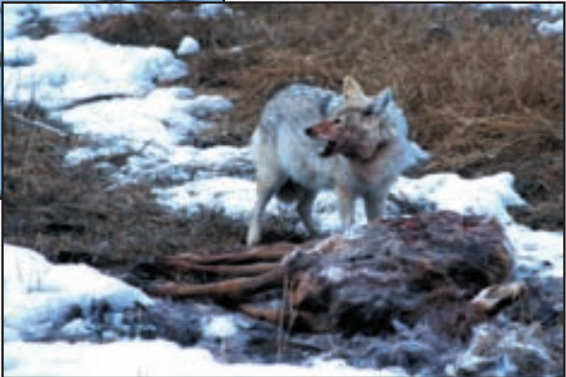
(below) Oryx, an African antelope, were brought to New Mexico and released at White Sands Missile Range in the 1960s and early 1970s.