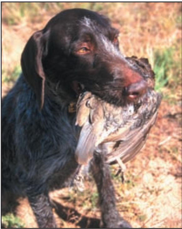
A “soft bite” is an instinctive trait of good retrievers.