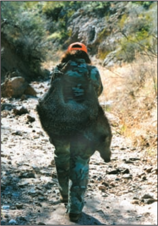
(above) A full-grown 60-pound peccary is a heavy load through the rocky canyons and hills of New Mexico’s boot heel region.