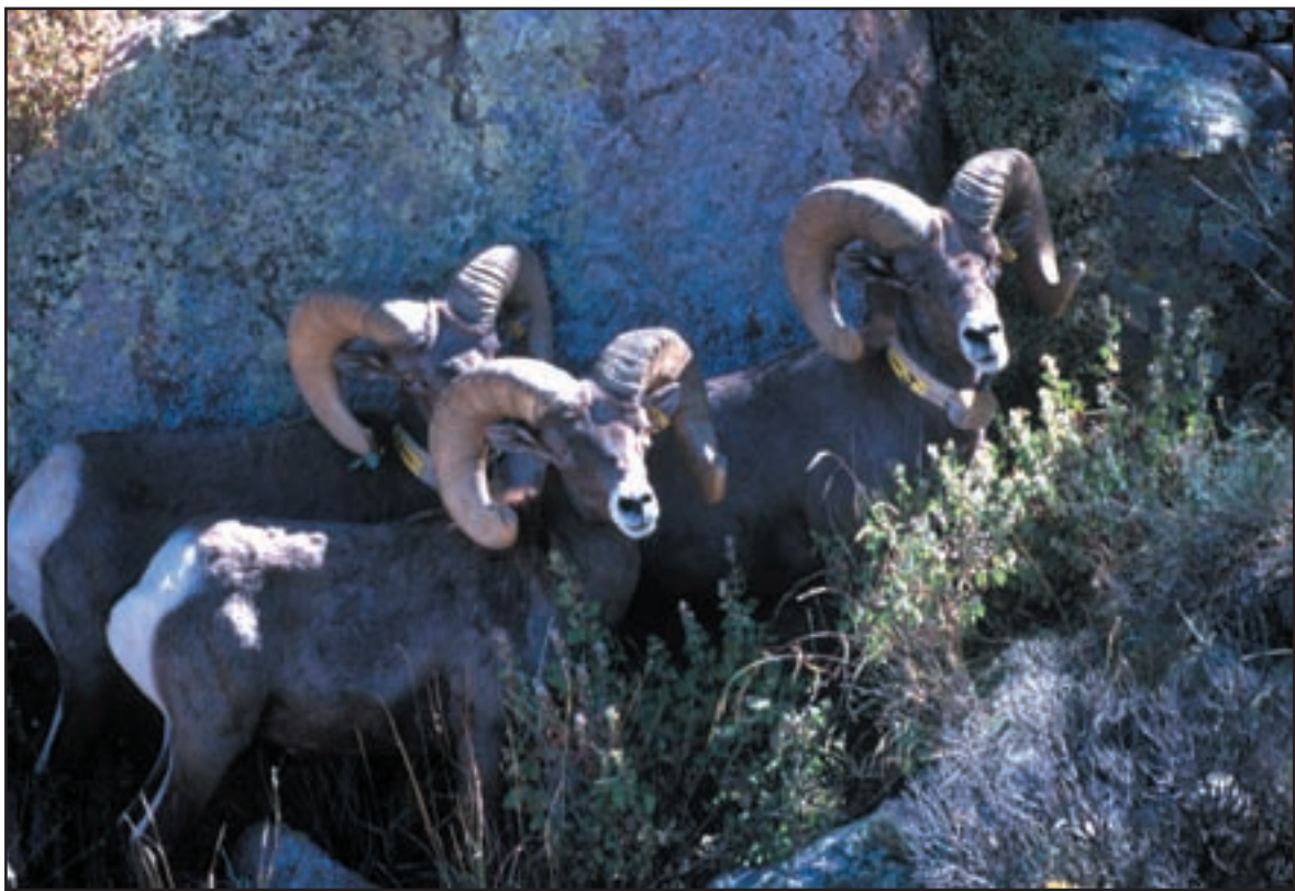
A captive herd of desert bighorn sheep at the Red Rock Wildlife Area has helped restore wild herds in southern New Mexico.