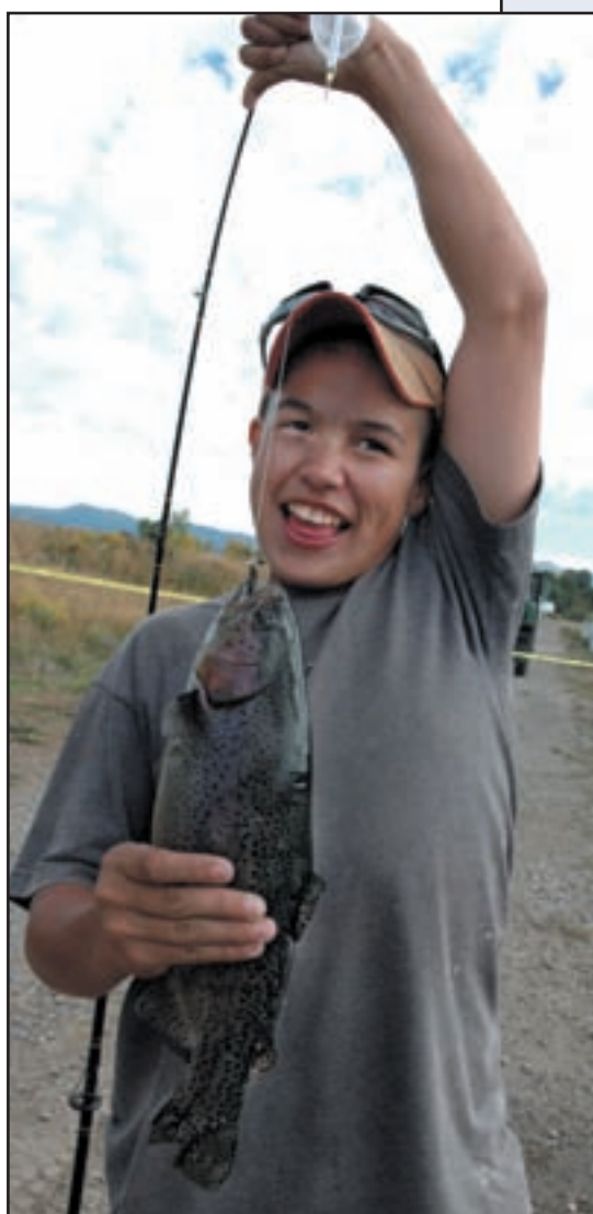
Big rainbow trout inspired big smiles Sept. 24, when Parkview Hatchery opened its runways for one day of public fishing.

The cliché goes, “A bad day fishing is better than a good day working,” but there is no cliché for an amazing day of fishing. Gigantic stringers of rainbow trout and a lift on fishing license regulations were the catches of the day at the Parkview Fish Hatchery on Sept. 24.