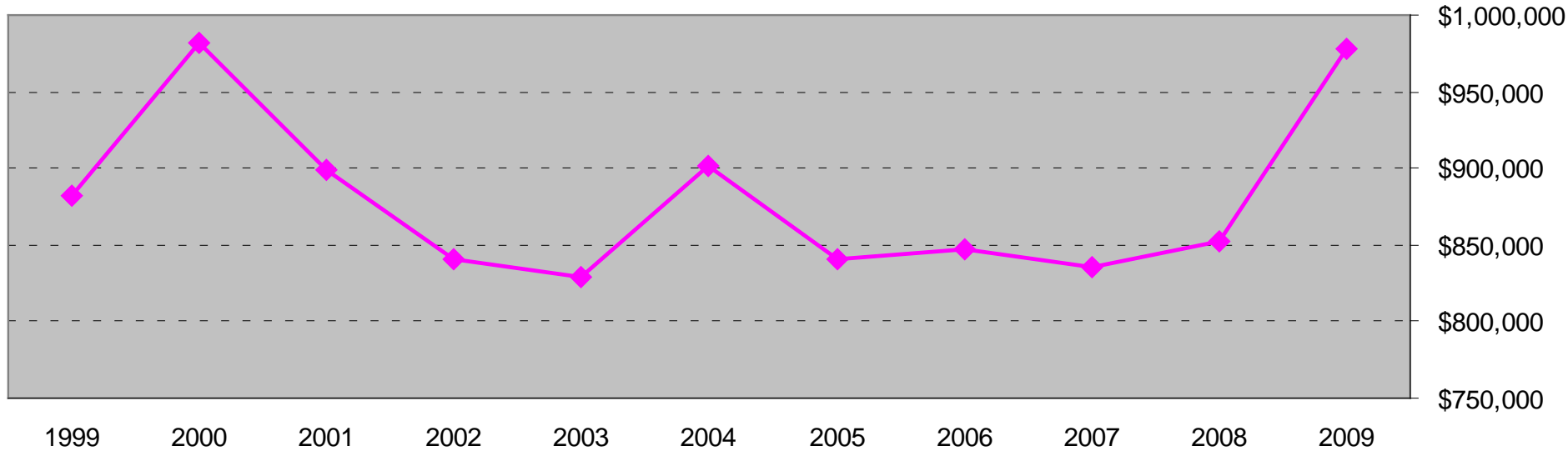
Habitat Stamp Sales