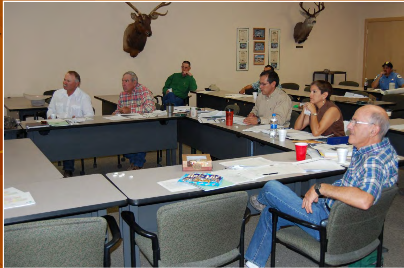
SW Advisory Committee members.

5 Citizen Advisory Committees have obtained public input, prioritized projects, and made these recommendations.