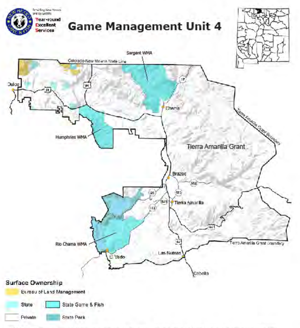
GMU 4: Beginning at the junction of the east boundary of the Jicarilla Apache Indian Reservation and the NM/CO state line and running east along the state line to the eastern boundary of the Tierra Amarilla Grant, then south along the east boundary of the Tierra Amarilla Grant and west along its south boundary to its junction with the east boundary of the Jicarilla Apache Indian Reservation, then north along the east boundary of the reservation to its junction with the NM/CO state line.