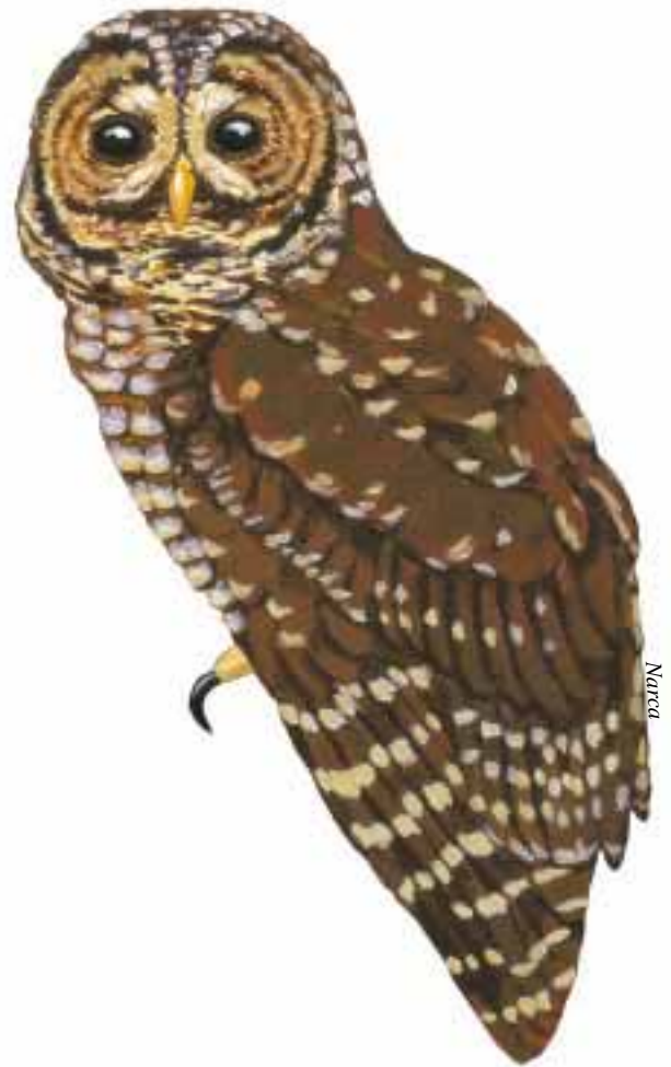
Mexican Spotted Owl